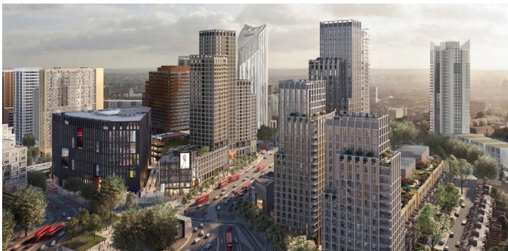
CGI of the Elephant and Castle Town Centre

For further information about the Elephant and Castle Town Centre visit: elephantandcastletowncentre.co.uk/lookingto-the-future