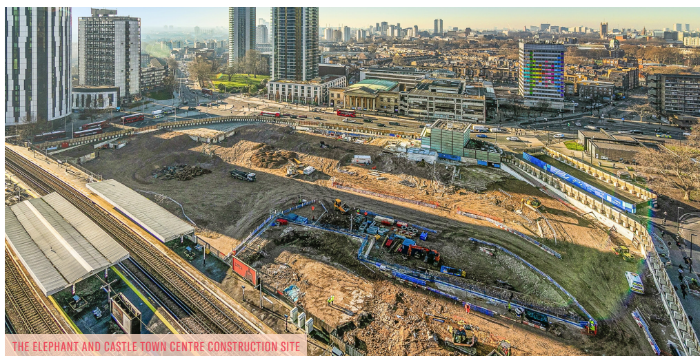
THE ELEPHANT AND CASTLE TOWN CENTRE CONSTRUCTION SITE